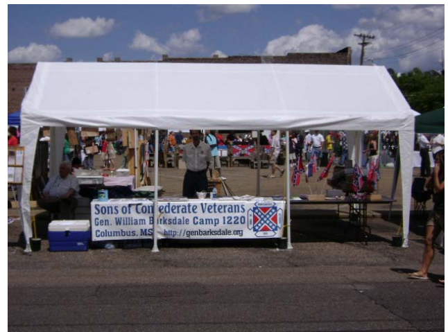
Camp 1220 had a double booth at Columbus's Market Street Festival on Saturday May 03, which featured a Display about "The Year of Davis" and the reopening of Beauvoir. There was estimated 25,000 people in